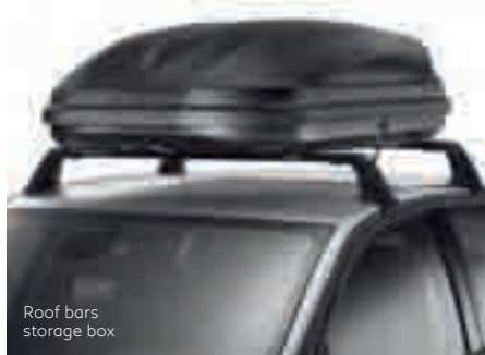
Roof bars storage box