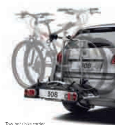
Tow-bar / bike carrier