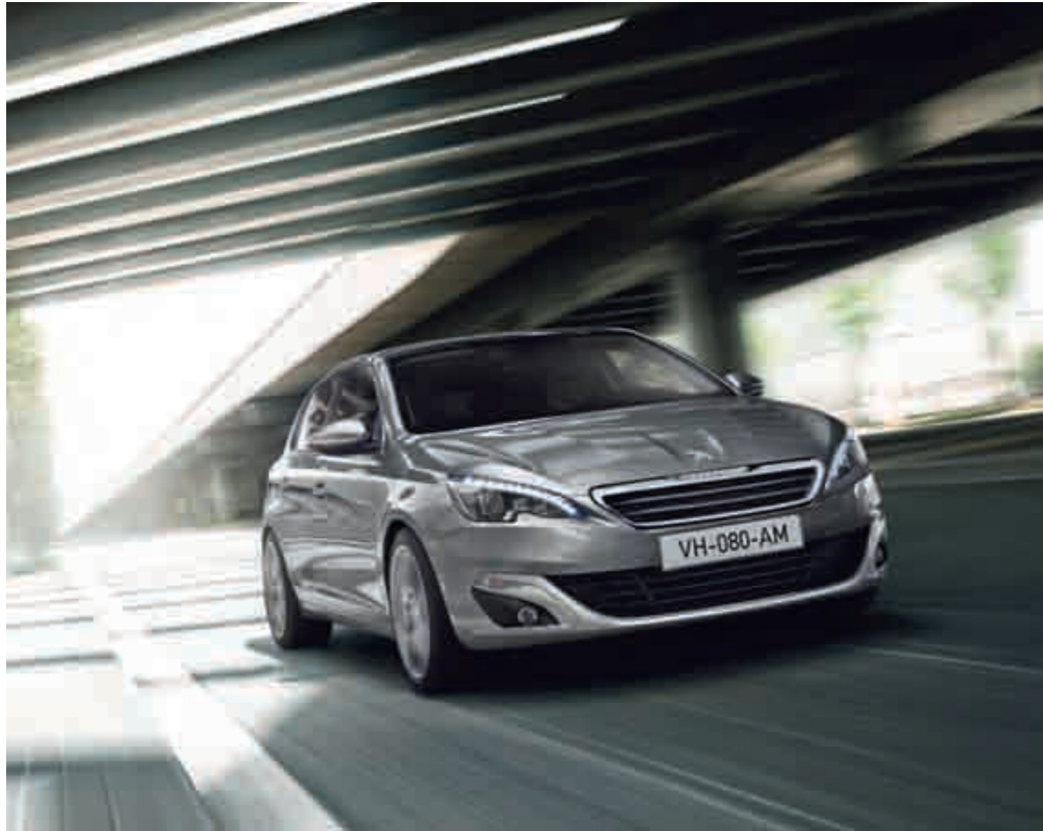
NEW PEUGEOT 308