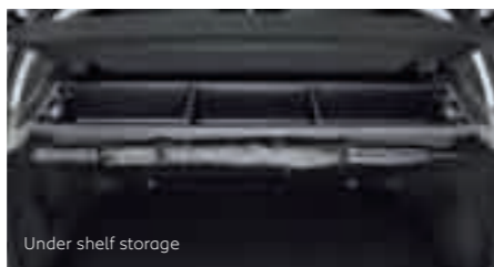
Under shelf storage