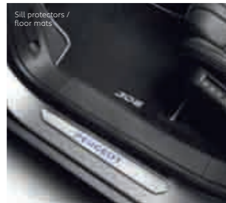
Sill protectors / floor mats