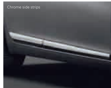
Chrome side strips